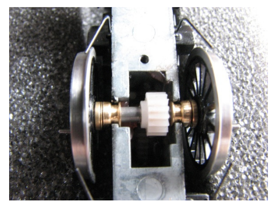
Driven axle with spacing washers placed in chassis.