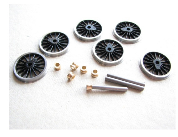
Alan Gibson 3F Conversion Pack

Before you start, it is a good idea to have some small containers or snap top poly bags to put screws and components in for safe keeping.....much better than crawling about on the floor trying to find lost bits!