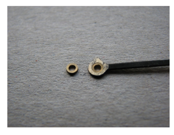
Bush inserted into rod ready for soldering.